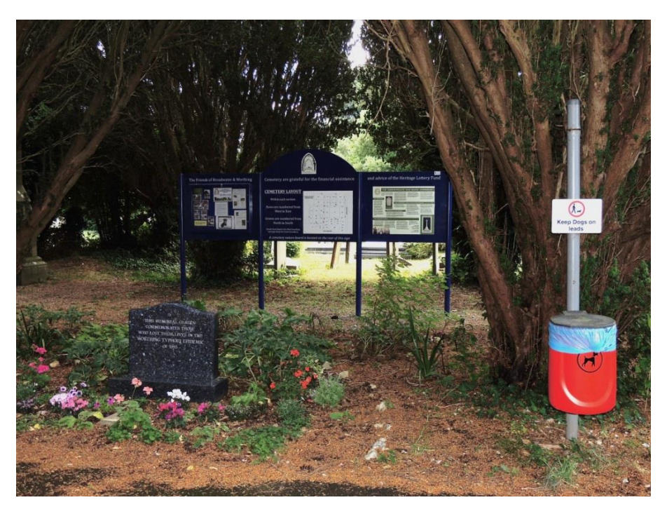
. [All photographs are by the Editor unless otherwise credited].

There was some good news for the cemetery in the late summer when the local authority provided a dog poo bin for Worthing and Broadwater Cemetery. This will hopefully encourage dog walking locals to use the facility. Dogs are welcome in the cemetery provided they are on leads and the owners 'pick-up' after their family pets. In the past there have been complaints about dogs running free and normal litter bins being filled with bags containing dog excreta. Also it can be quite unpleasant for cemetery maintainers if they encounter faeces during their clearance work. So, from all at FBWC, well done Worthing and Arun Council.